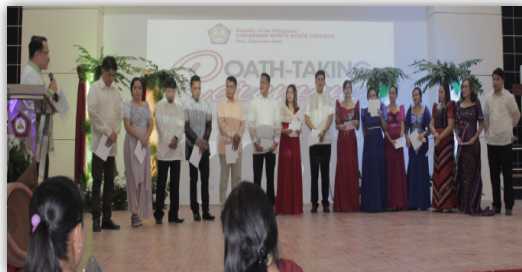
The newly hired and newly promoted non-teaching personnel