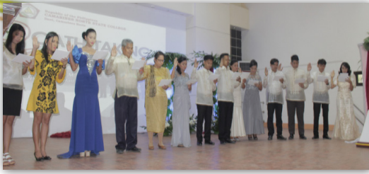
The newly hired faculty