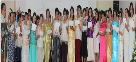
The newly promoted faculty