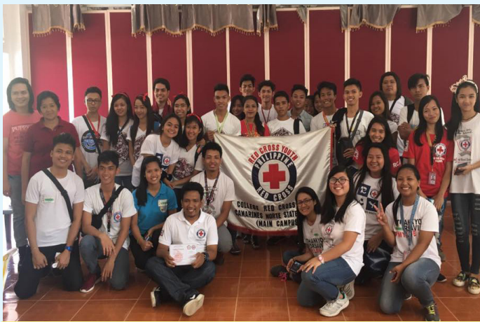
The Philippine Red Cross (PRC) Blood Services of Camarines Norte and the members of Camarines Norte State College Institute of Fisheries and Marine Sciences (IFMS) Red Cross Youth Council (RCYC)

The Philippine Red Cross (PRC) Blood Services of Camarines Norte and the members of Camarines Norte State College Institute of Fisheries and Marine Sciences (IFMS) Red Cross Youth Council (RCYC) conducted an orientation about