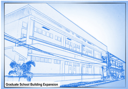
Graduate School Building Expansion

Featuring the newly constructed Entrance Pavilion and Entrepreneurship Building funded under Income with 8 commercial spaces, auditorium, dormtel for guest and visitors plus the state of the art architectural entrance design that has a multifunctional purpose for big events, like graduation, foundation anniversary and other school activities would be an indicator that we are moving ONward to Excellence.