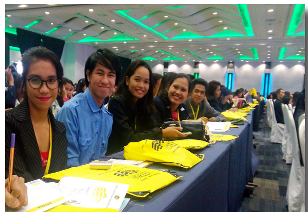
Students of the BSBA Financial Management at SMX Convention Hall, MOA, Pasay City.