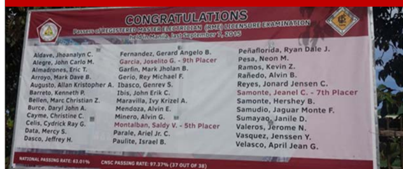
Banners for the Passers of the Licensure Examination for Registered Master Electrician.