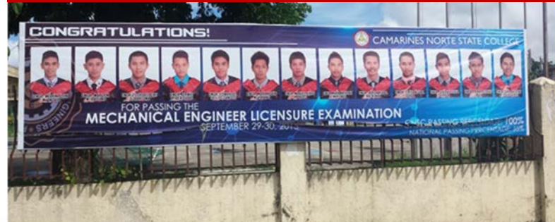
Banners for the Passers of the Licensure Examination for Registered Mechanical Engineers.