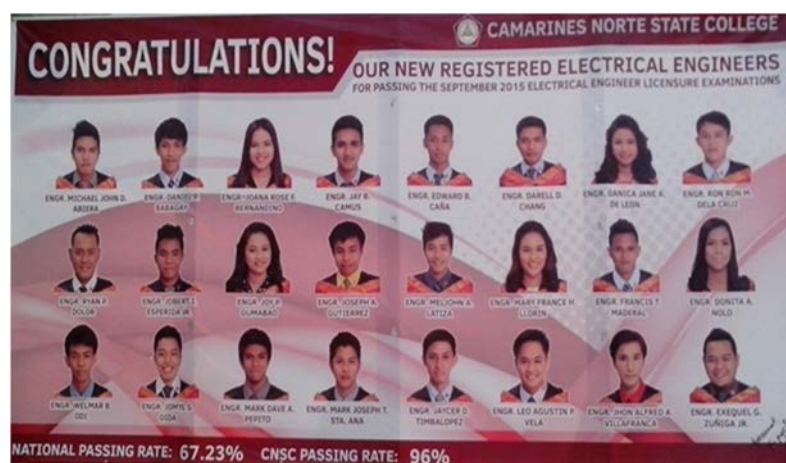
Banners for the Passers of the Licensure Examination for Registered Electrical Engineers.