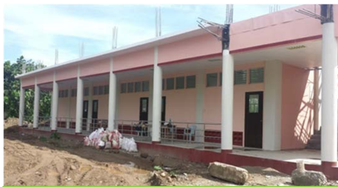
Another ongoing Engineering Building at the CNSC Main Campus beside the main library.