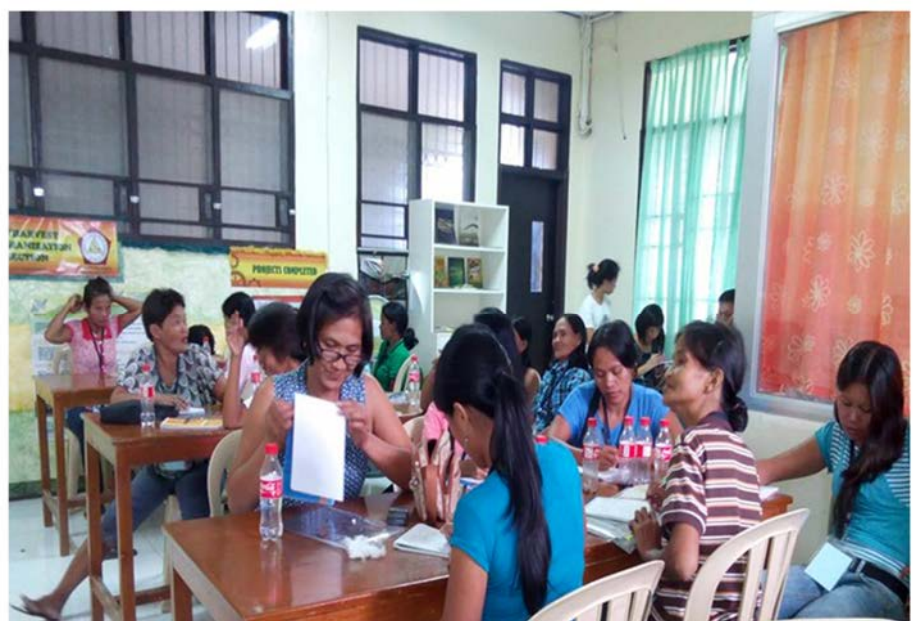
Active participation of attendees of the program.