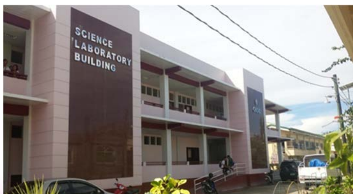
Science Laboratory Building now ready to accommodate Engineering laboratory activities and equipment at CNSC Main Campus in front of the main library.