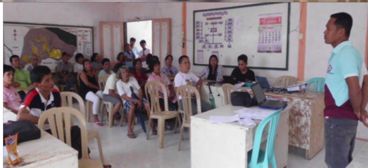
(Top) The participants, facilitators and members of Sangguniang Barangay pose after the forum. (Bottom) The resource person listens carefully to the questions from the participants during the open forum.

This implementation of uniform criteria for grading also envisions eliminating subjectivity in grading students based on other criteria, as indicated in Board Resolution No. 30, s. 2014.