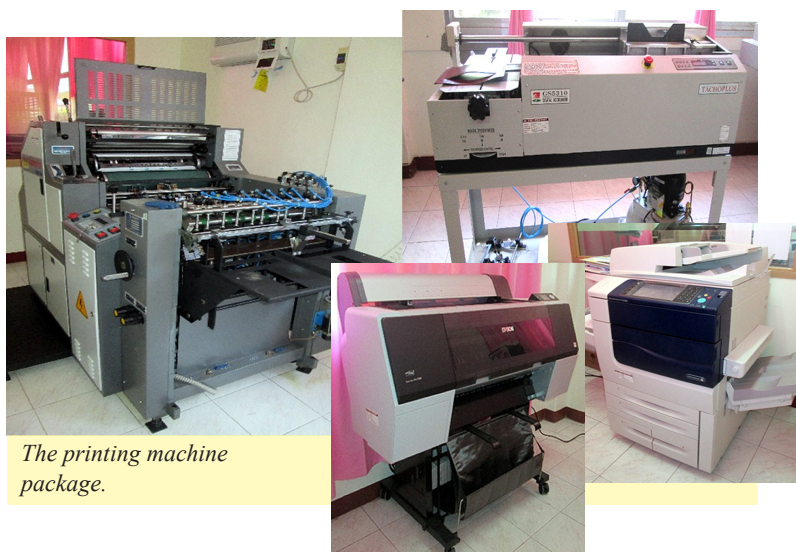
The printing machine package.

As a government agency, CNSC continuously utilizes its fund according to its mandate. The printing machine package is expected to generate income for the Institution through its production-related projects.