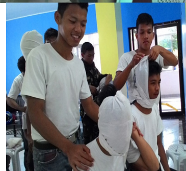
CBPA faculty and students listening intently to the Naturopathic Doctor while giving lecture (top). Students' actual demonstration (above).

Generally, the activity is in line with the college's thrust to boost gender-related activities through timely and relevant training and demonstration that are beneficial to all participants.