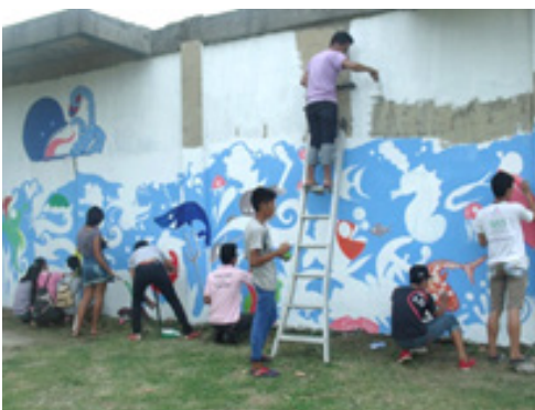
CNSC-MC students painting the mural.

As part of the annual celebration, the CNSC – Mercedes Campus conducted a two – day event in lieu of the Fish Conservation Month called Bughaw Festival. The CNSC – Mercedes Campus, through