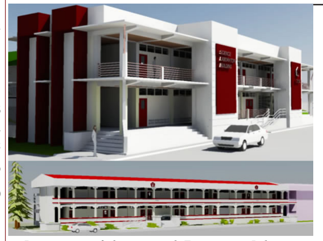
Perspectives of the approved Engineering Laboratory Building and Two-Storey Academic Building.