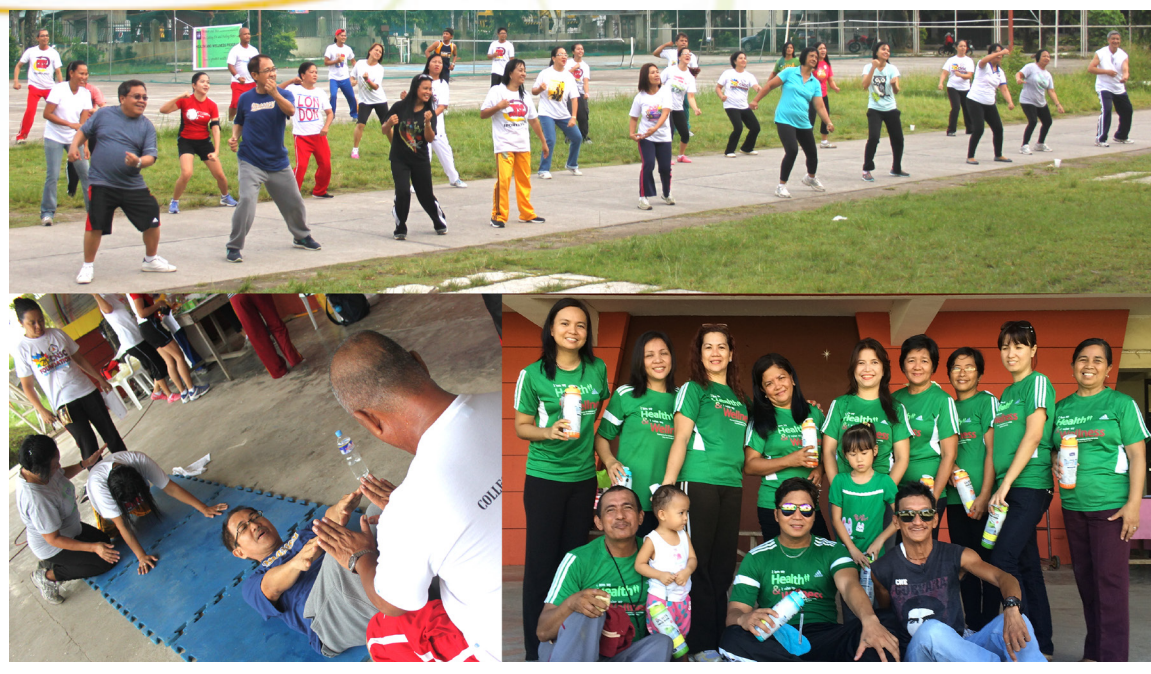
(Top) The participants groove to the music during the dancercise. (Left) The participants go through a fitness test before the start of the program. (Right) The facilitators and regular participants of the Health and Wellness Program.

To attain the objectives of the program, the two-hour session for at least twice a month is packed with the following activities: body conditioning (stretching), jogging/running, dancercise/aerobics, drills (jumping, sprinting, leaping, hopping), games (parlor games,