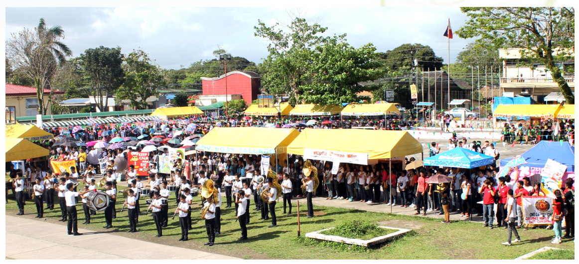
CNSC community in festive mood during the Opening Program to commence the 8th Hayag Festival

In support of the National Arts Month Celebration, CNSC conducted the 8th HAYAG Festival on February 26-28, 2014. It is an artistic academic, socio-cultural and spiritual celebration that basically supports the CNSC Vision and Mission. The event covered competitions in different fields such as Visual Arts, Music, Dance and Literary which also includes different activities